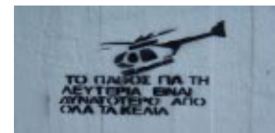
the passion for freedom is stronger than the prison

Saturday, ... July, 18.20, four masked armed men entered the premises of Azur-Helicoptere at the Cannes-Mandelieu airport in the south of France. They immobilised three employees and, taking a pilot with them at gunpoint, got him to take one of the helicopters under orders to 'look straight ahead'.