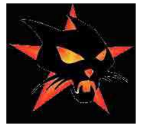
more info: actforfree.nostate.net en.contrainfo.espiv.net