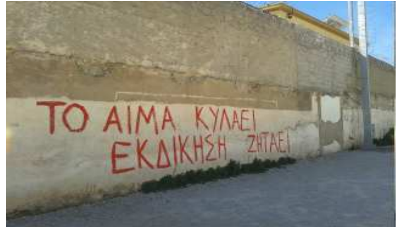
The blood is still flowing seeking revenge