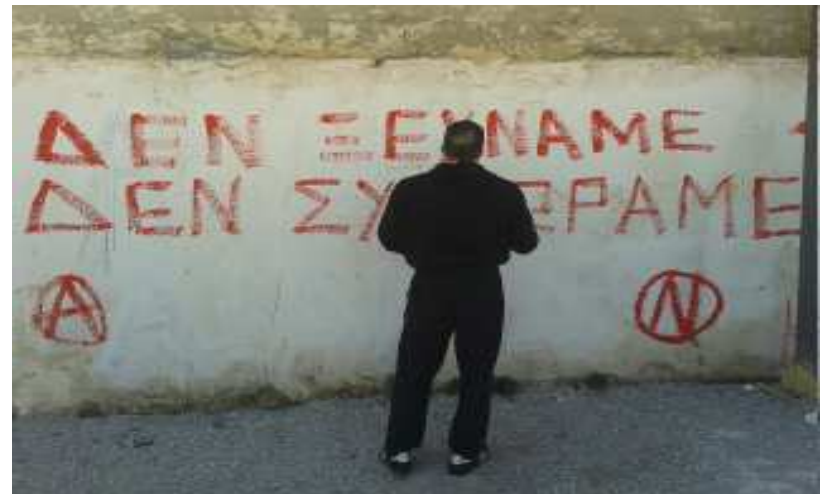
(A) We don't forget, we don't forgive (N)