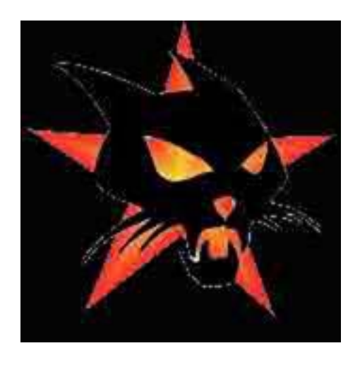
Act for freedom now!boubourAs actforfree.nostate.net